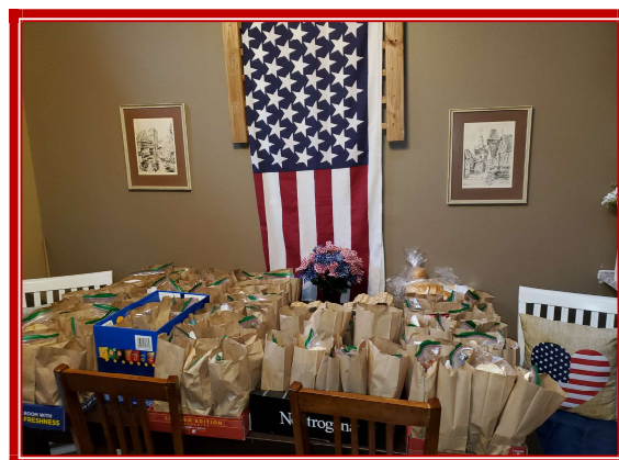
One of our many groups of lunch makers and the thousands of lunches made and delivered.