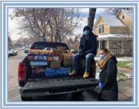
1500 sandwiches made by many volunteers.