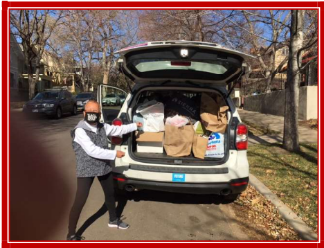
Roz Heise... one of our Delivery Divas